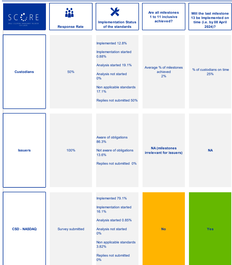
Figure 1 Summary of the monitoring exercise

Custodians' response rate (50%) remained low, and it is affected from the fact that not all Estonian custodians change SWIFT messages between themselves and CSD and therefore didn't answer the questions.